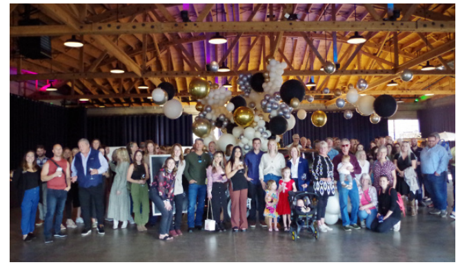
The Motor Co Grand Opening and Ribbon Cutting 10/5