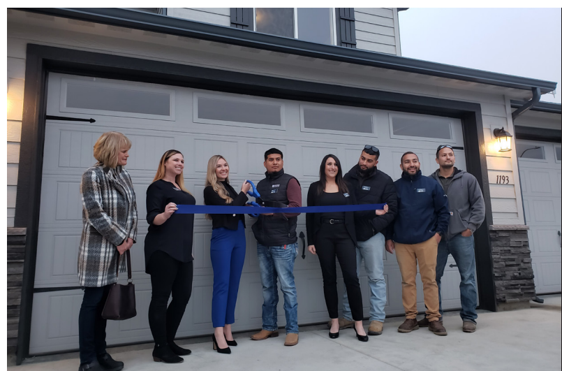
Hayden Homes Ribbon Cutting 11/09

We hosted 22 Ribbon Cuttings for grand openings, anniversaries, re-brandings and relocations in 2023. We look forward to helping even more Walla Walla Valley businesses celebrate with the big scissors in 2024!